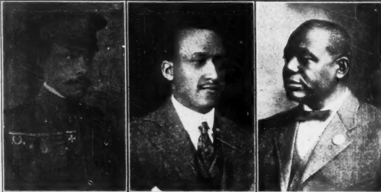
HENRY T. BURLEIGH